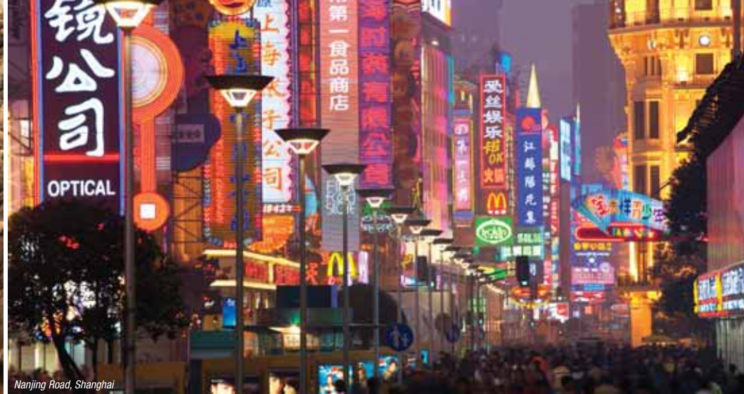
Nanjing Road, Shanghai