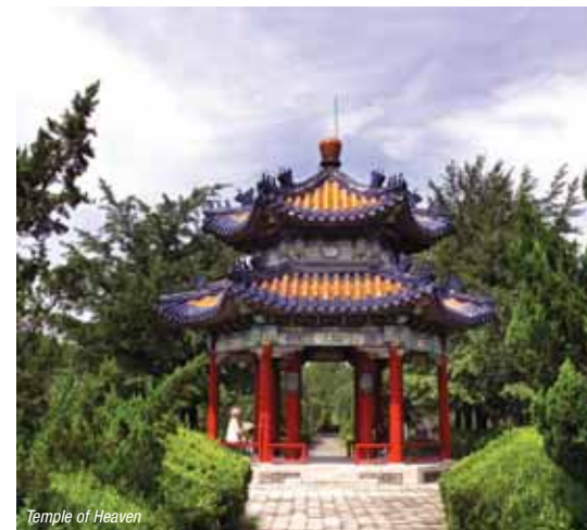
Temple of Heaven