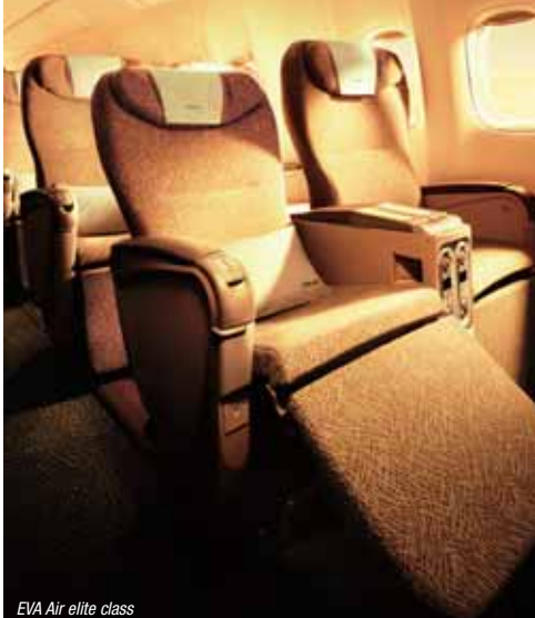
EVA Air elite class