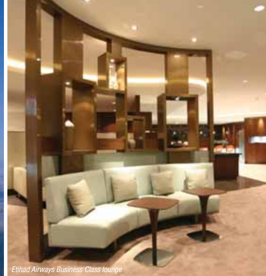
Etihad Airways Business Class lounge